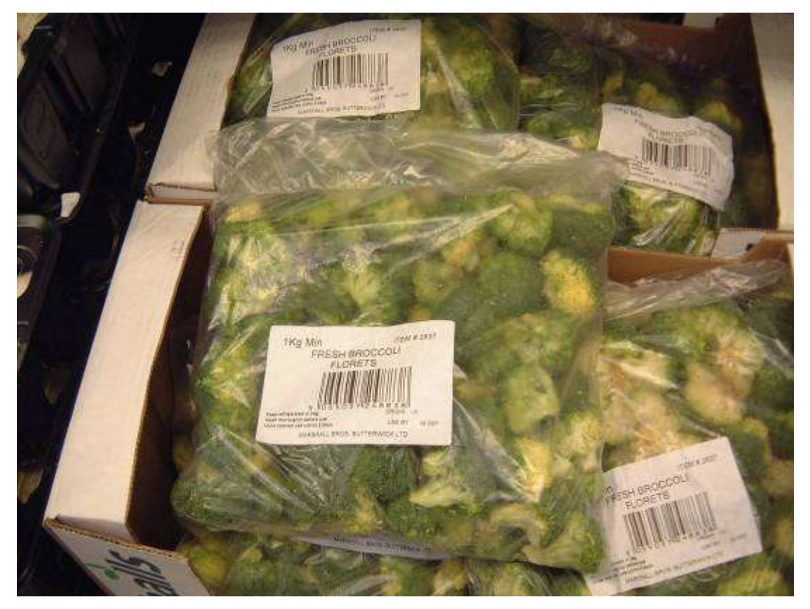
Plate 4. Food service pack: Broccoli florets.