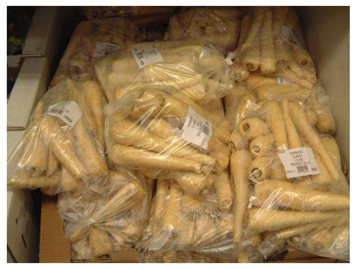
Plate 5. Food service pack: Parsnips.