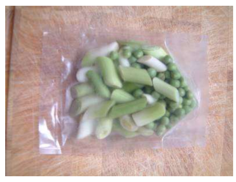
Plate 2. Steamer pouch: Peas and leeks