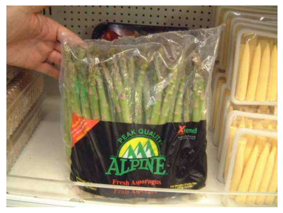
Plate 1. Microwaveable retail pack: Asparagus

The MA within the retail pack may be created passively or by actively flushing the package with a gas mixture. The former is typically used for whole or minimally processed produce; the latter is used for bags of salad vegetables.