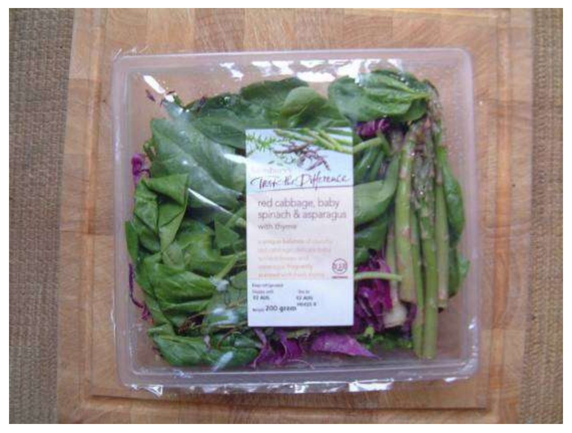
Plate 3. Tray with heat-sealed MAP film: Mixed vegetables